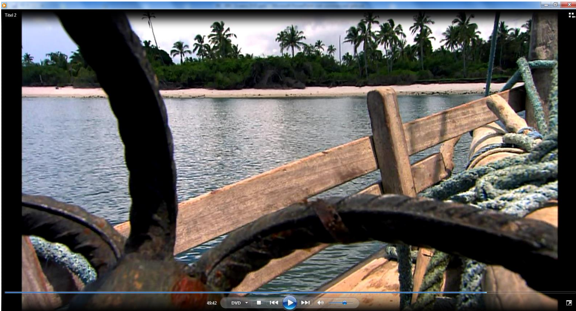
View to the Ras Kisimani shoreline