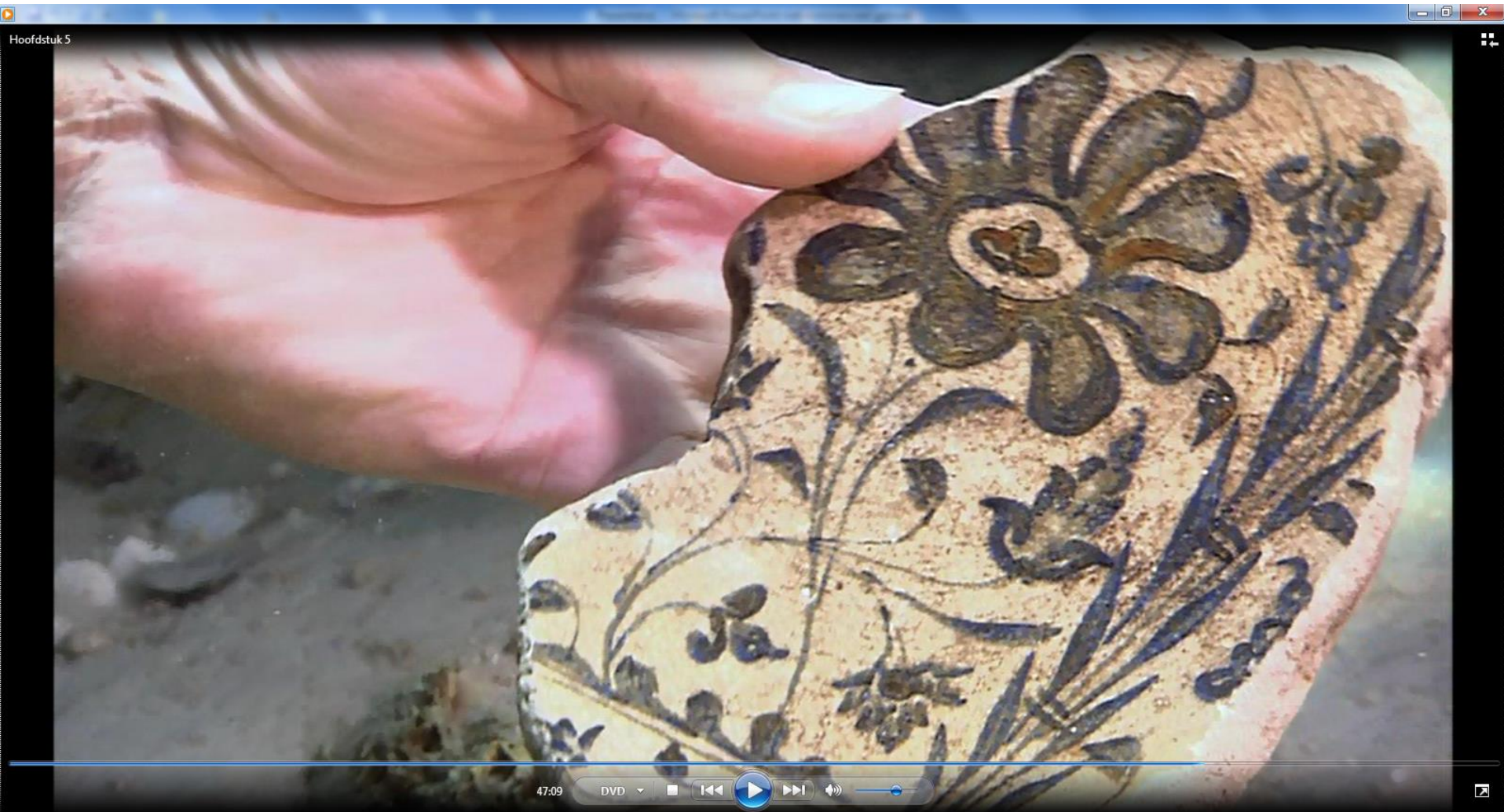
15th century claywork from Persia